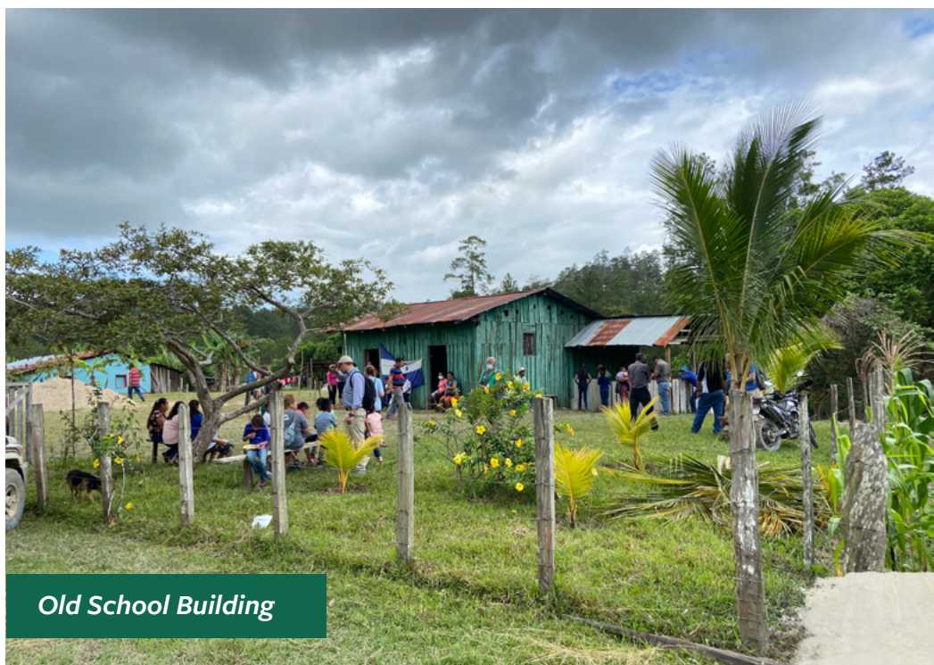
Old School Building