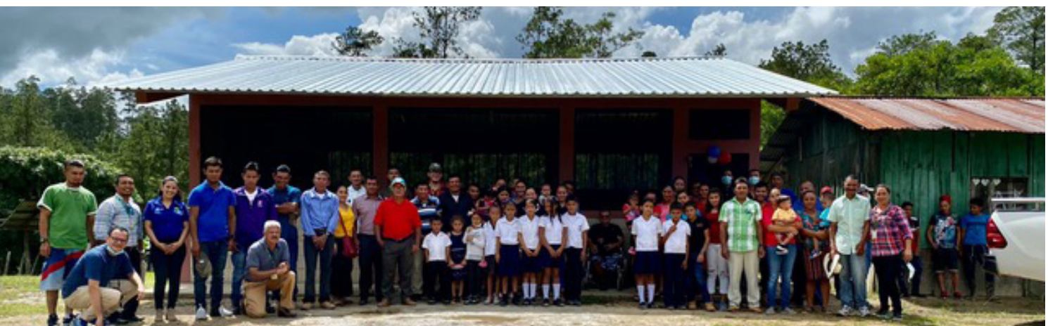
New School Building